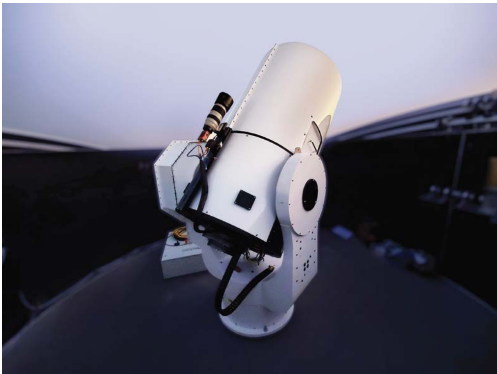
The X-lumin Lasercom Optical Ground Station

One of the first commercial systems to offer full optimization of spectrum, capacity, speed and safety all in one place, the X-lumin Lasercom OGS leads in nextgen capabilities. Uniquely designed for reliability, flexibility and cost effectiveness, we create lasercom systems specific to client requirements.